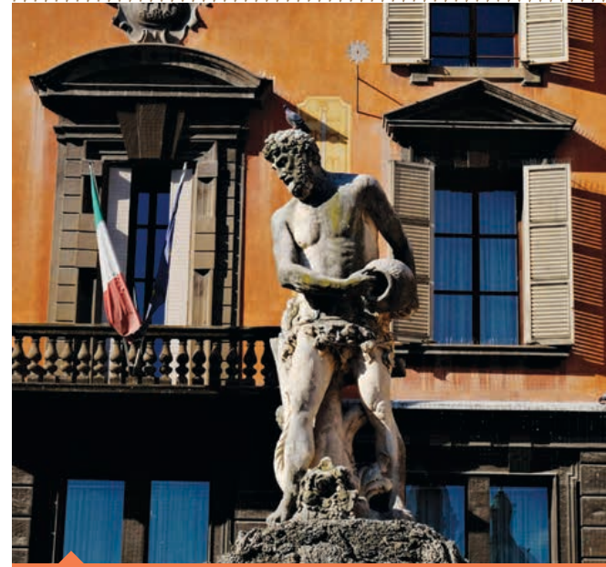
Crostolo statue, Piazza Camillo Prampolini, Reggio Emilia

Italian educators and researchers provide a full week of seminars, presentations, school tours and various ways to experience the local culture. The Denver delegation—educators from Montessori, Head Start, local districts, university faculty and students—spent hours discussing what they learned and the environments they experienced. What they discovered is that the people of Reggio are not interested in sharing a "prescription" for the world to follow. Rather, their intention is to create dialogue: to question together what lessons may be learned, what possibilities we see in their work for our own settings and what ideas we might share with them.