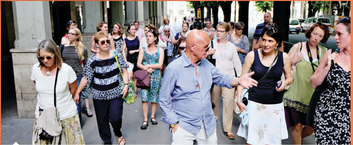
A tour through the historic city of Reggio Emilia for the Denver delegation.

A TTENTION TO THE IMPORTANCE and potential of the early years of a child's life has never been greater. We know how important a child's first years are because of new knowledge gained from brain research and economic studies. Both show the return on investment for children whose development is promoted in their early years versus the cost of repairing the consequences of poor development in later years. In city, state and national policy forums, educators and legislators are discussing ways to invest in quality early care and education from birth to age 12.