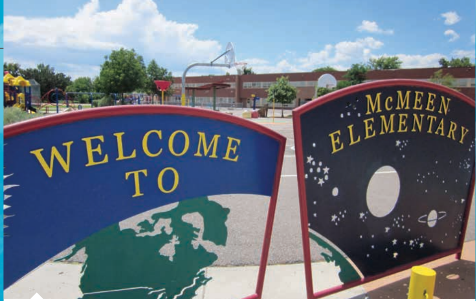
McMeen Elementary, a participating school in this residency, is a place where diversity is celebrated. More than 27 different languages are spoken among its students.

the classroom. The program, if successful, will create more highly qualified teachers in hard-to-staff positions in DPS and will also create a promising model that we know creates high-quality educators.”