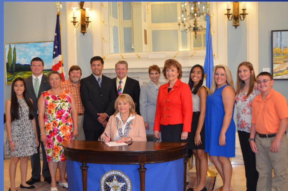
Oklahoma Governor Mary Fallin signs SB262

The State Department of Education, in collaboration with the Oklahoma Department of Labor, shall make available to school districts information regarding workplace safety training for grades seven through twelve. Such information shall include the NIOSH "Youth@ Work Talking Safety: A Safety and Health Curriculum for Young Workers."