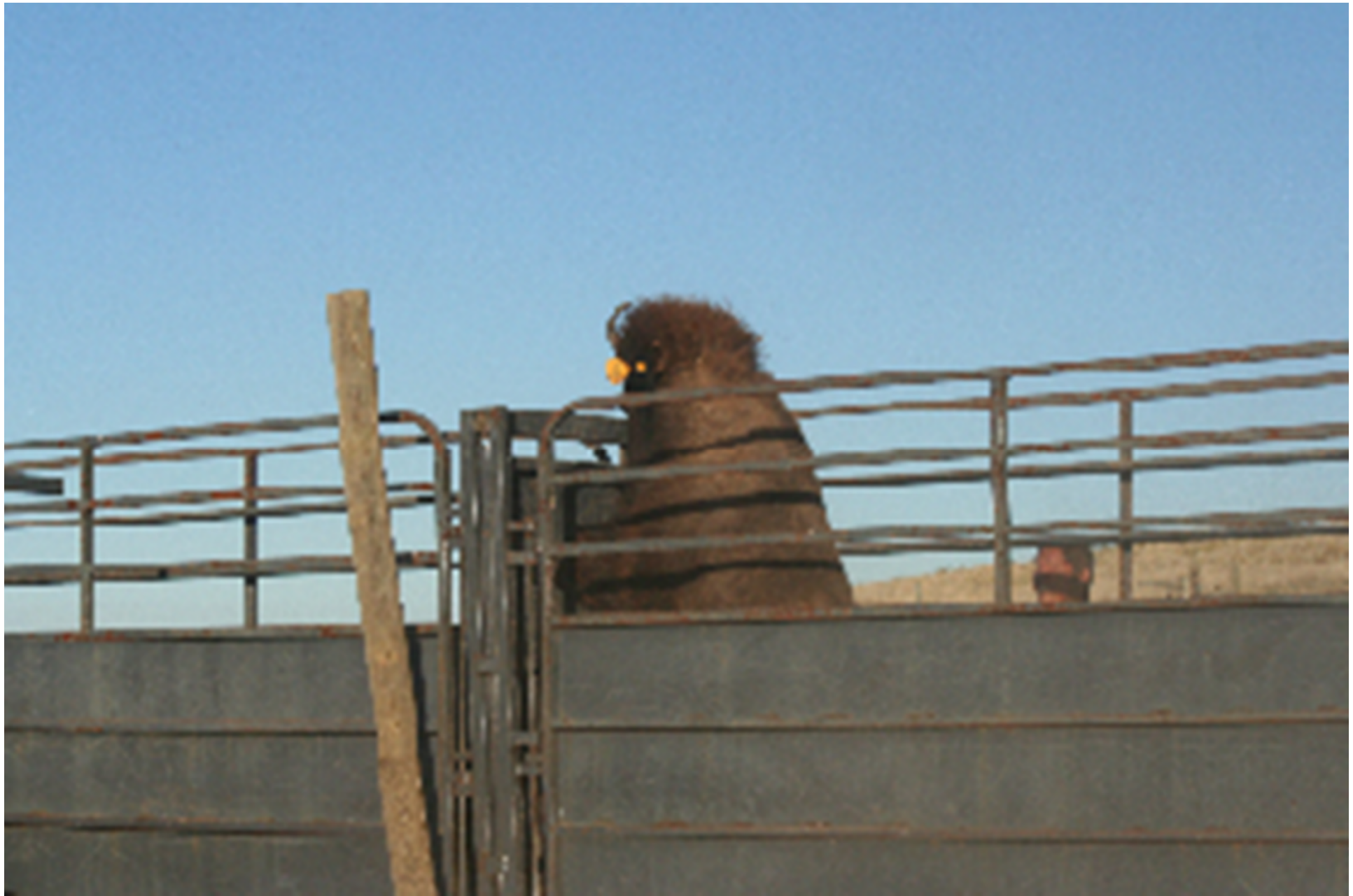
Daily Bison Handling Worker Safety Survey - observations at 10 bison roundups. Bison Worker Safety Survey 40 bison herd managers and 9 veterinarians.