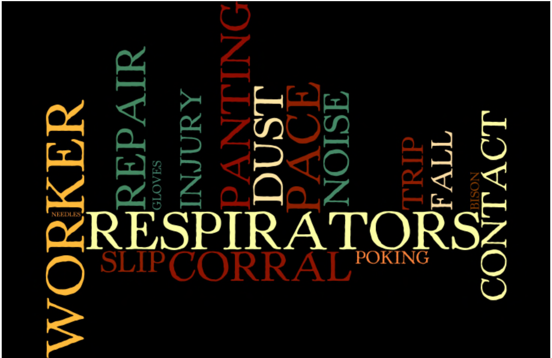
Observational Surveys – Injury Burden and Personal Protective Equipment needs